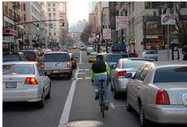
Riding on SW Broadway in Downtown Portland

In what researchers call the first study ever to examine the relationship between traffic-related air pollution exposures and cardiac health among people who ride bikes, a study published last month found that cycling near heavy traffic "may have a significant impact" on heart health.